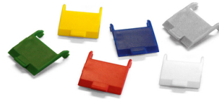
MS-C6 A 1/8 Cat.6 A (IEC) 180°-K (Keystone) RJ45 module and dust shutters